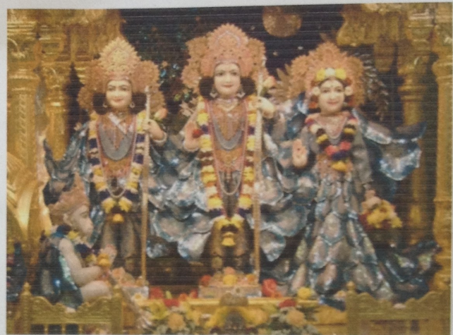
Hanuman (near left), Brother Lakshmana (left) Ram (centre), Sita (right)

All these years, Hindus have been celebrating Ramnavami and doing Ekadashi on this day yet many parents have been asked by their children “why do we celebrate Ramnavami?” and have given the vaguest and unclear definition that it is Bhagwan’s or “jeje’s” birthday. However this is partly the reason as to why we celebrate Ramnavami and there is more to it.