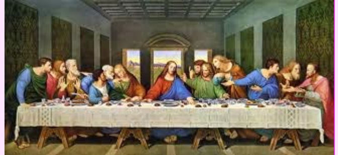
The Last Supper by Leonardo Da Vinci

One day when Jesus was eating his supper with his twelve friends, one of his friends asked him why he was looking so sad. Jesus replied saying that someone in the room had betrayed him and that he was to join his Father in heaven soon. To allow his followers to remember him while he was gone, Jesus broke some bread and said 'This is my body. Take it and eat it and remember me.' Then he took a cup of red wine, saying 'This is my blood. Drink it and remember me.' This dinner was known as the last supper. The next day, while Jesus was praying in the Garden of Gethsemane, all of a sudden hundreds of roman soldiers, who had wanted him dead for a